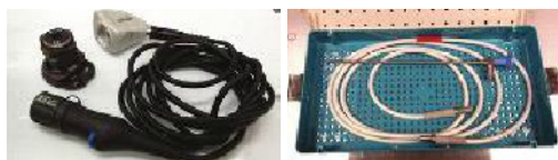
Fig. 1 - Manually cleaned devices

In sterile processing, knowing if the endoscopes and other heat sensitive devices are ready to be safely handled is of the utmost importance. The wide array of medical devices can be grouped under three rubrics based on how they are cleaned: manually cleaned, machine-cleaned or a combination of both.