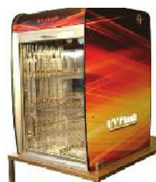
Fig. 4 - UV Flash Disinfectant

Hearing staff concerns and addressing their issues by bringing new research into practice is the mantra for an ever evolving sterile processing department. At the end I would like to say do your due diligence, because when it comes to safety, tomorrow is too late, today is about time! HPN