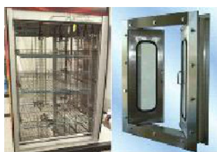
Fig. 2 - UV Disinfectant placed at Pass through window

There is a novel concept that adds a level of safety to handling manually cleaned devices on the clean side of the sterile processing area. This no-touch technology does not replace manual cleaning, but supplements it. The concept is to pass the manually cleaned devices from the decontamination side to the clean side through an ultraviolet (UV) disinfection system that is placed in the pass through window (Fig. 2). This way, the manually cleaned devices are further disinfected before they come to the clean side. This concept is similar to the well-established use of UV radiation to disinfect hospital rooms.