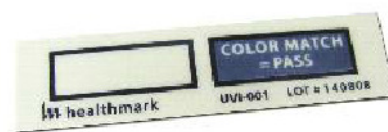
Fig. 5 - UV Indicator from Healthmark Industries, Fraser, MI

After swabbing, the clean devices were passed through the UV disinfectant (Fig. 4). The cycle time of the UV disinfectant was one minute. A bacterial count was taken on both the manually and mechanically cleaned instruments after they came out of the UV disinfectant.